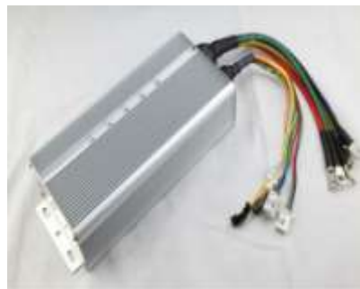
Fig No. 1 Controller

The controller was selected as per the power requirement of the motor to accelerate and decelerate. Selected controller was a 24 tube type compatible with motor considered, which will provide the power indirectly the (rpm)to the motor as per user requirement. Proper spacing is provided to the controller in the frame of the vehicle as it is considered a crucial and delicate part of the vehicle which is responsible for the acceleration of wheels.